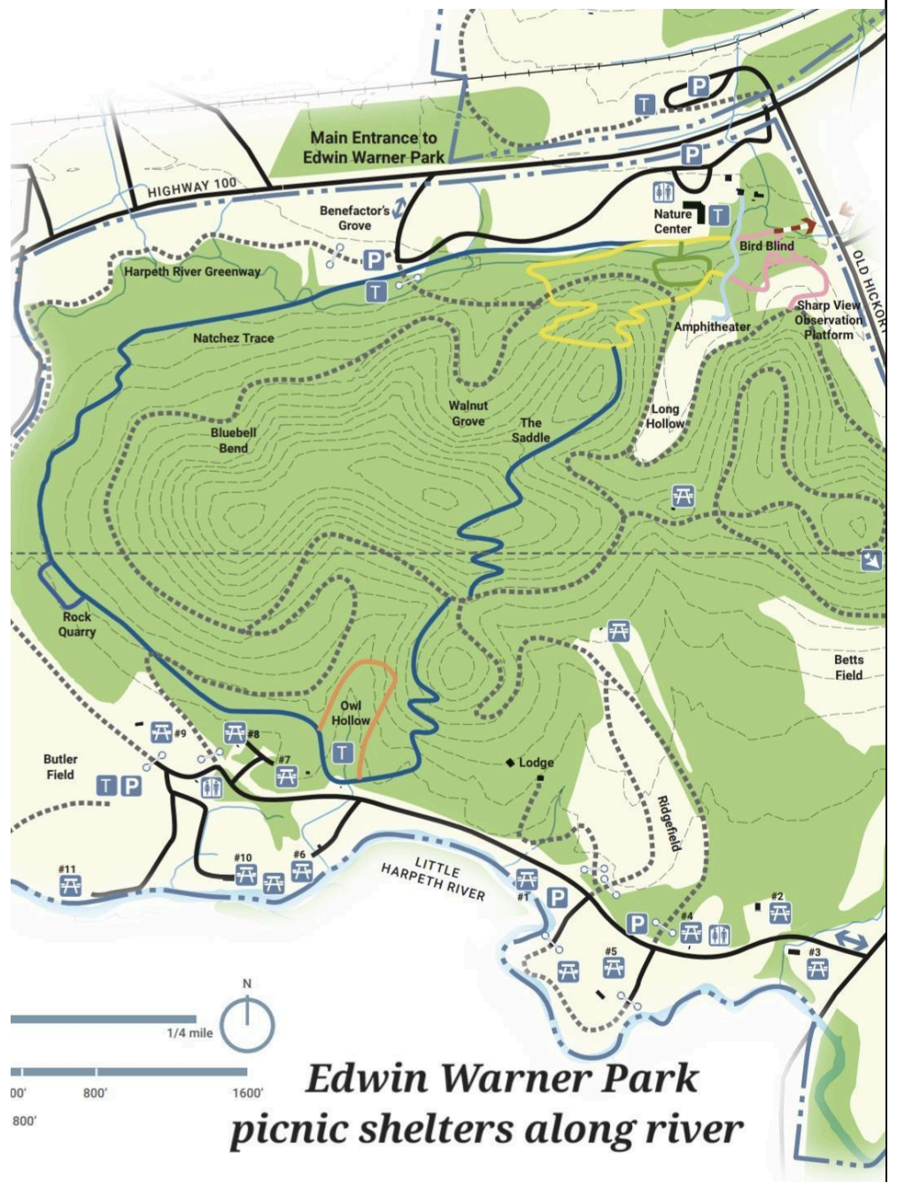
Edwin Warner Park picnic shelters along river